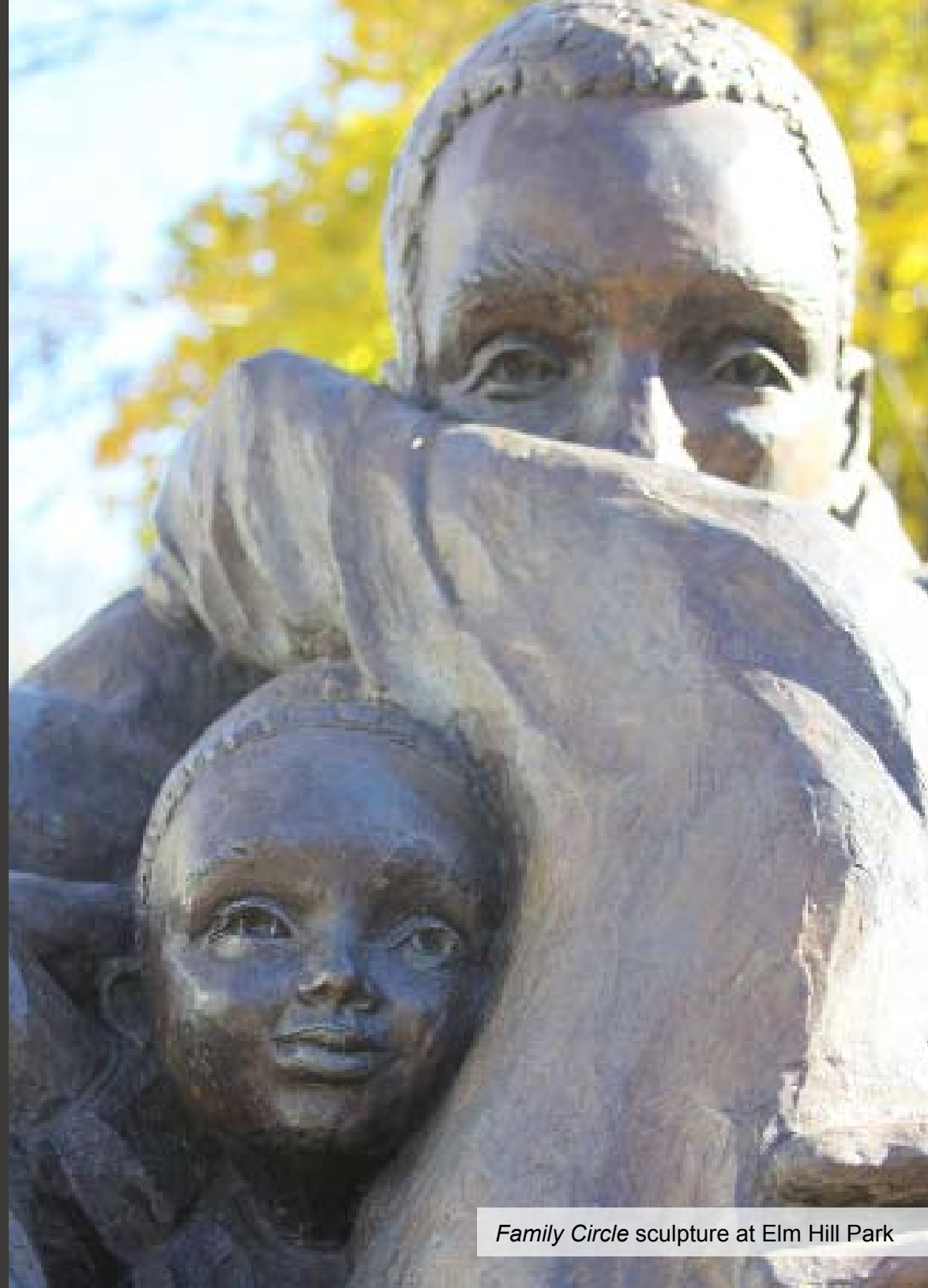
Family Circle sculpture at Elm Hill Park