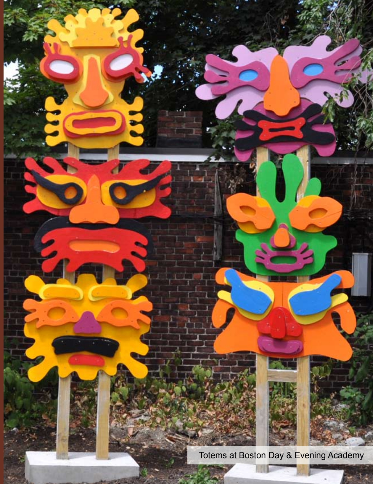
Totems at Boston Day & Evening Academy